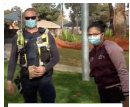
Local Police regularly attend to ensure we have a CovidSafe market.

We also welcome community groups and individuals the opportunity to busk each market. We had put a pause on this activity throughout the COVID restrictions but look forward to